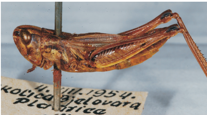
Figure 3. Stenobothrus crassipes from the BP collection. Female habitus.

Within the species of the genus Stenobothrus occurring in the Pannonian region (the Carpathian basin) St. crassipes is the most easily recognizable. All the other